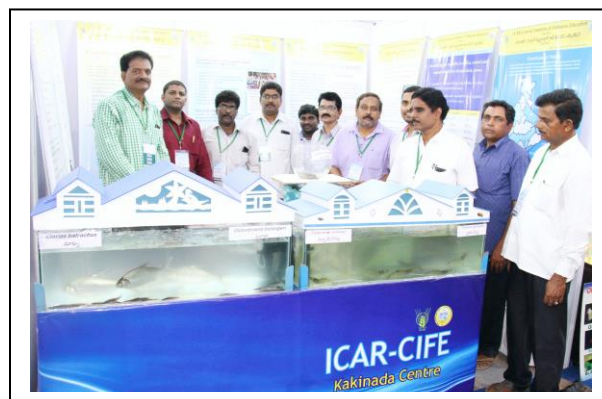
View of the ICAR-CIFE, Kakinada stall