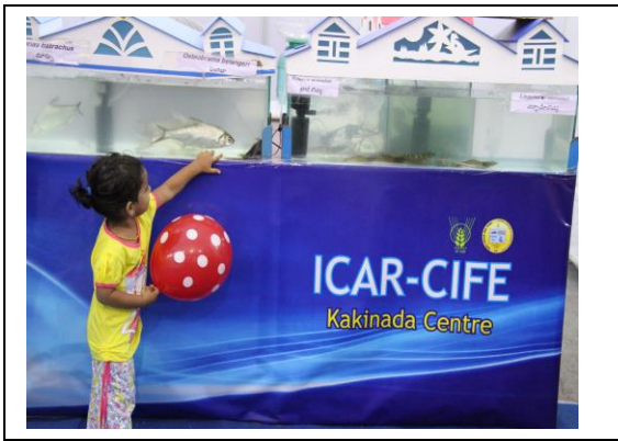
A school going kid is keenly observing the Pengba fish