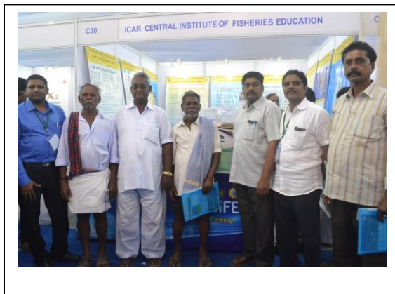
A group of fish farmers from Biccavolu area are being briefed about the activities of ICAR-CIFE, Kakinada Centre.