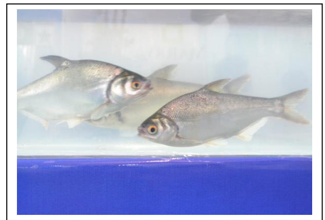
Pengba fish display at the stall.