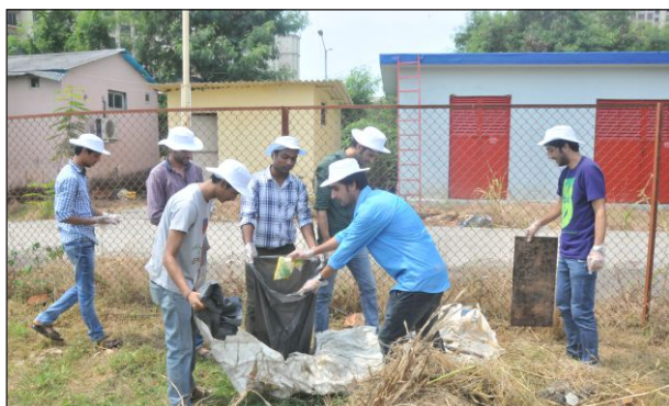
Swatcha Bharat _ 28 September 2014