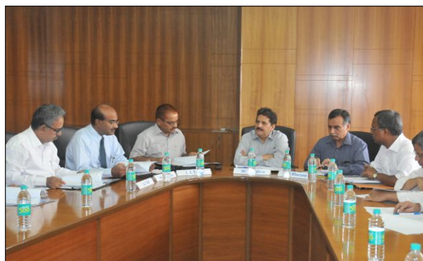
Academic council Meeting - 15 May 2014