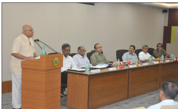
QRT Meeting - 20 May 2014