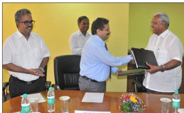
CIFE signs MoU with CAU, Imphal 14 June 2014