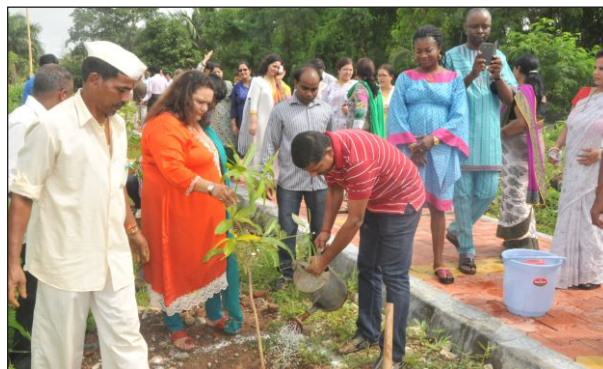
Plantation on Independence day - 15 August 2014